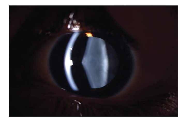
Figure-2: Slit lamp examination showing anterior protrusion of lens

peri-macular dot and fleck retinopathy (Figure-3). Pure tone audiometry (PTA) with speech testing confirmed bilateral sensorineural hearing loss. Complete blood count showed normal values. Serum blood urea nitrogen (BUN) and creatinine levels were elevated. BUN: creatinine ratio was 6, indicating an intrinsic renal disease. Urine examination showed marked haematuria and proteinuria. Chest X-ray and ECG were normal. Patient was advised to undergo clear lens extraction with intra-ocular lens (IOL) implantation in both the eyes and was referred to nephrology and otorhinolaryngology department for further management. Patient did not give any family history except for her first-degree aunt who was suffering from renal failure.