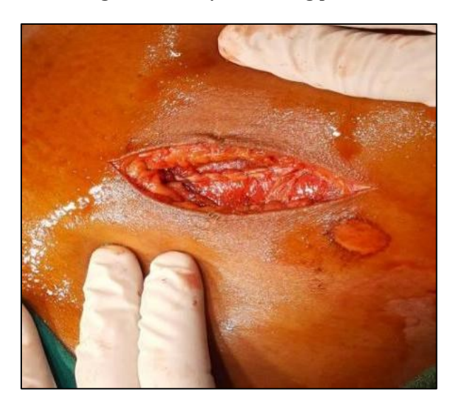
Figure-5: Closure of fascia